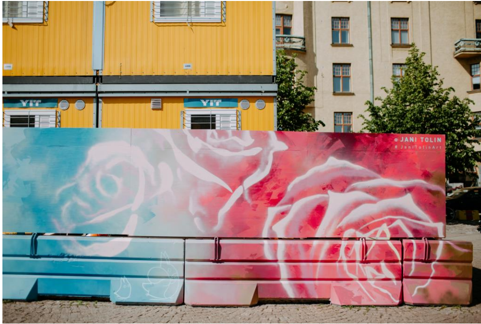
Roses and Totoros. Totoros down on the left.